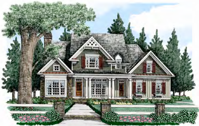
Designed by Frank Betz Associates, Inc.