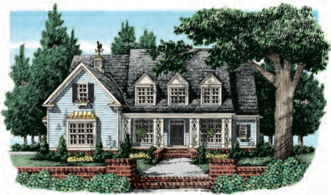
Designed by Frank Betz Associates, Inc.