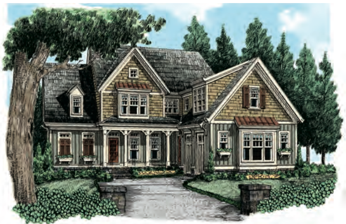
Designed by Frank Betz Associates, Inc. Copyright Southern Living.